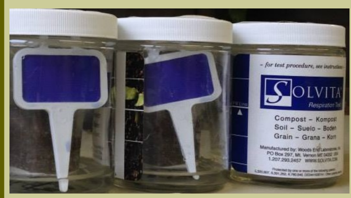
Some biological soil tests use color-changing paddles to indicate soil respiration, which serves as a proxy for soil nitrogen.

Traditional fertility recommendations assume that soils do not hold significant stores of plant-available nitrogen (as measured by soil nitrates). While this assumption may be valid in degraded, conventionally-tilled fields with little organic matter, the assumption breaks down in healthy soils which have been cover-cropped and are not tilled. In these latter soils, significant amounts of plant-available nitrogen are organic, which traditional soil tests do not measure. As a consequence, nitrogen is overapplied. To gain a more complete picture of soil fertility in healthy soils, farmers are beginning to use biological soil tests, such as the Haney Soil Health Test, to measure organic nitrogen pools and supplement their standard soil test results.